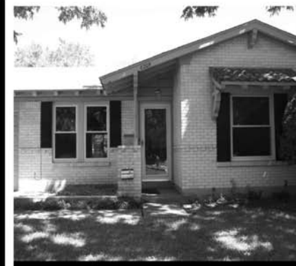
8209 Daleview Drive $225,000

Decorating our yards with the American Flag on Memorial Day for 21 years now!