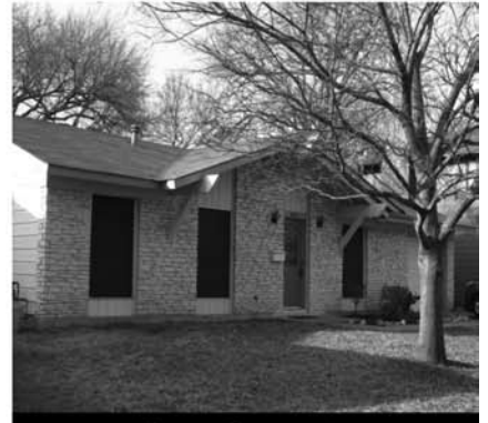
8012 Stillwood Lane $259,000